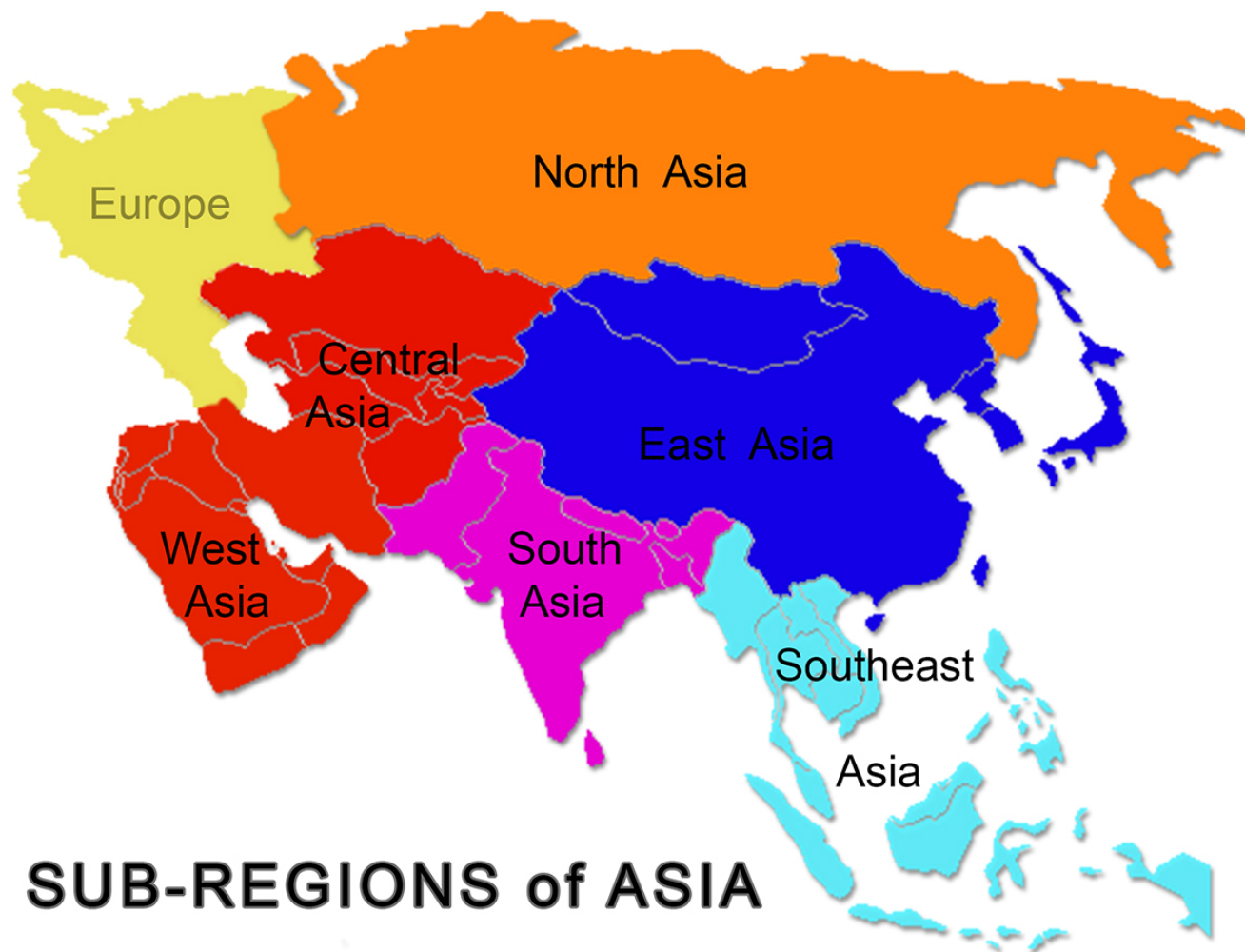
SUB-REGIONS of ASIA